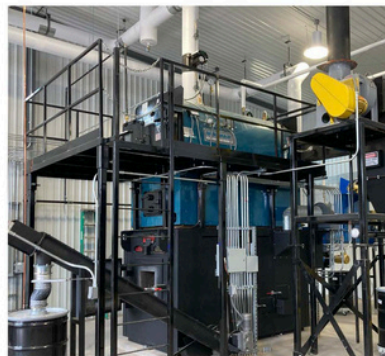
Brookston Community Center's woodchip-fueled hydronic boiler uses cutting-edge top-feed fuel technology to eliminate clogs and minimize maintenance downtime.

We provide energy navigation support to federally recognized Indian Tribes, Alaska Native Corporations, Intertribal Organizations (including Tribal consortia), Tribal Energy Development Organizations, and Tribal Colleges and Universities by directing information requests between Tribes, DOE, and interagency partners about: